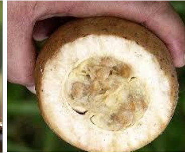
Ethical supply chains Benefit sharing agreements