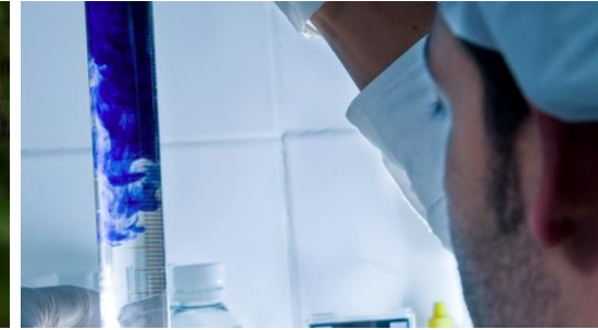
ABS principles in R&D